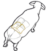
Fig.3 Porterhouse T-Bone