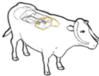
Fig.7 Prime Rib