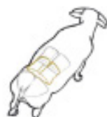
Fig. 3 Prime Rib