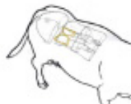
Fig. 8 Chateaubriand