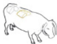
Fig. 2 Sirloin