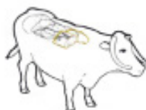
Fig. 7 Tri-tip