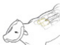
Fig. 1 Rib-eye