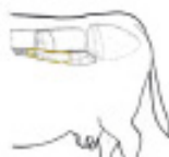
Fig. 6 Fillet