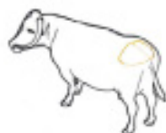
Fig. 4 D-Rump