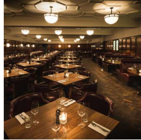
Guildhall EC2V 5BQ