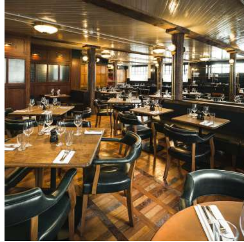
Borough SE1 9AQ