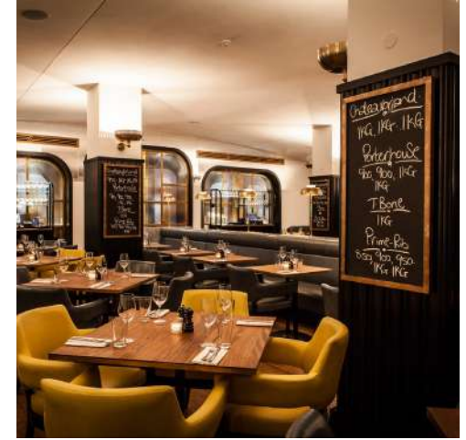
Knightsbridge SW3 2AL