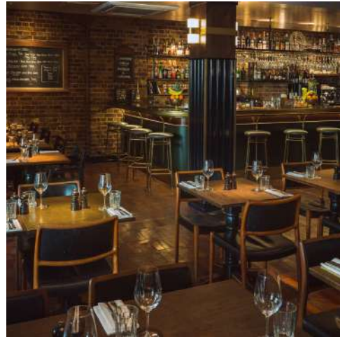
Spitalfields E1 6BJ

All our restaurants are available for full hire. To enquire, please email events@thehawksmoor.com