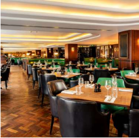
Air Street W1J 0AD