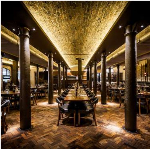
Seven Dials WC2H 9JG